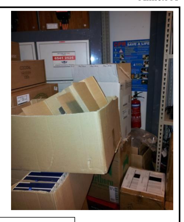
Obstruction to fire extinguisher

Goods placed near MCP may lead to accidental fire alarm activation