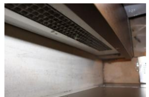
Figure 4 – Front view of vent beside of the toilet bowl where cigarette butts were squeezed through