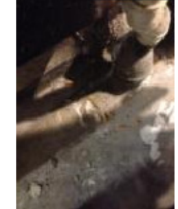
Figure 6 – Cigarette butts found squeezed through vent at T3 male toilets