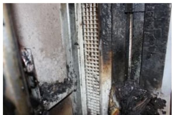
Figure 3 – Vent at the side of the toilet bowl showing cigarette butts being squeezed through