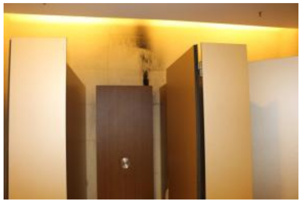
Figure 1 – Front view of affected cubicle

Annex A - Photographs of fire scene and indiscriminate disposal of cigarette butts