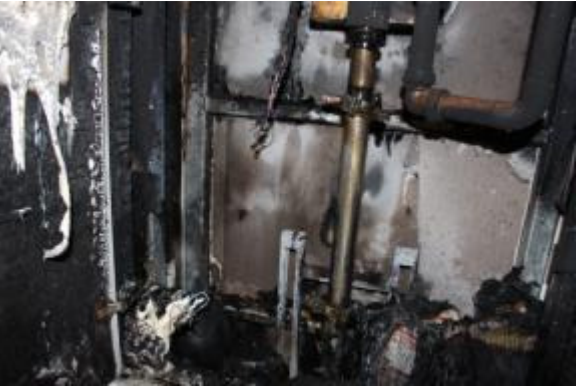
Figure 2 – Burned cabinet within service duct