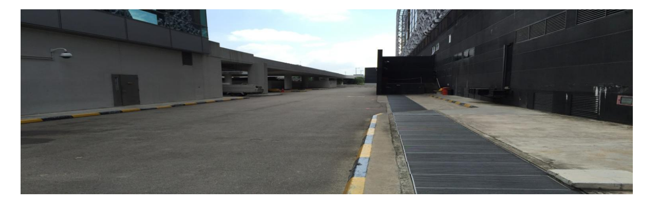
For South Assembly Area (AA3E)- South Coach Stand