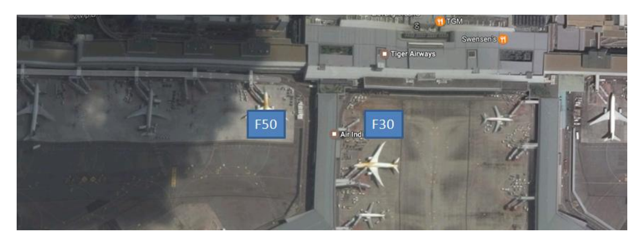
Parking Stand F50