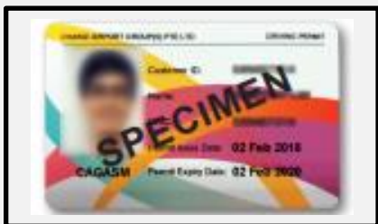
Airfield Driving Permit (Front)