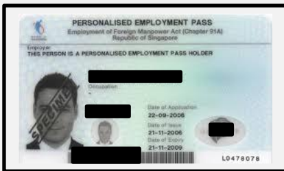
Work Permit (Front)