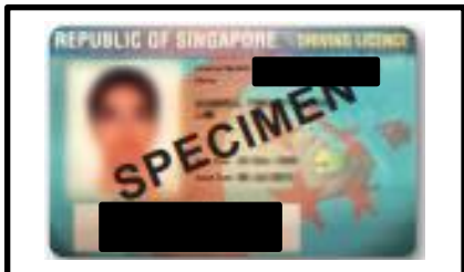
State Driving License (Front)