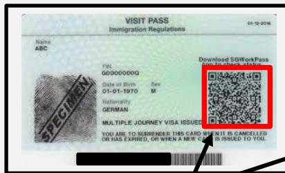
Work Permit (Back)