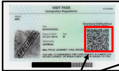
Work Permit (Back)