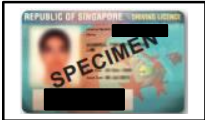
State Driving License (Front)