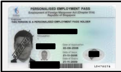
Work Permit (Front)