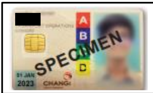
Airport Pass (Front)