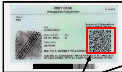
Work Permit (Back)