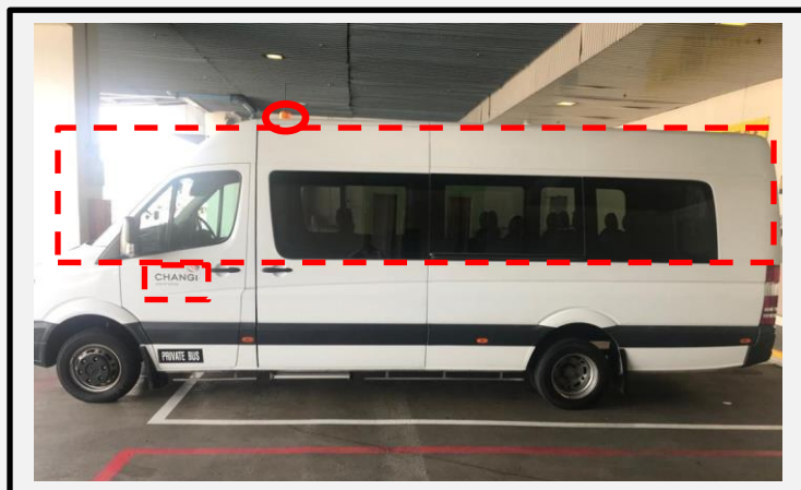
Vehicle (Side 2)