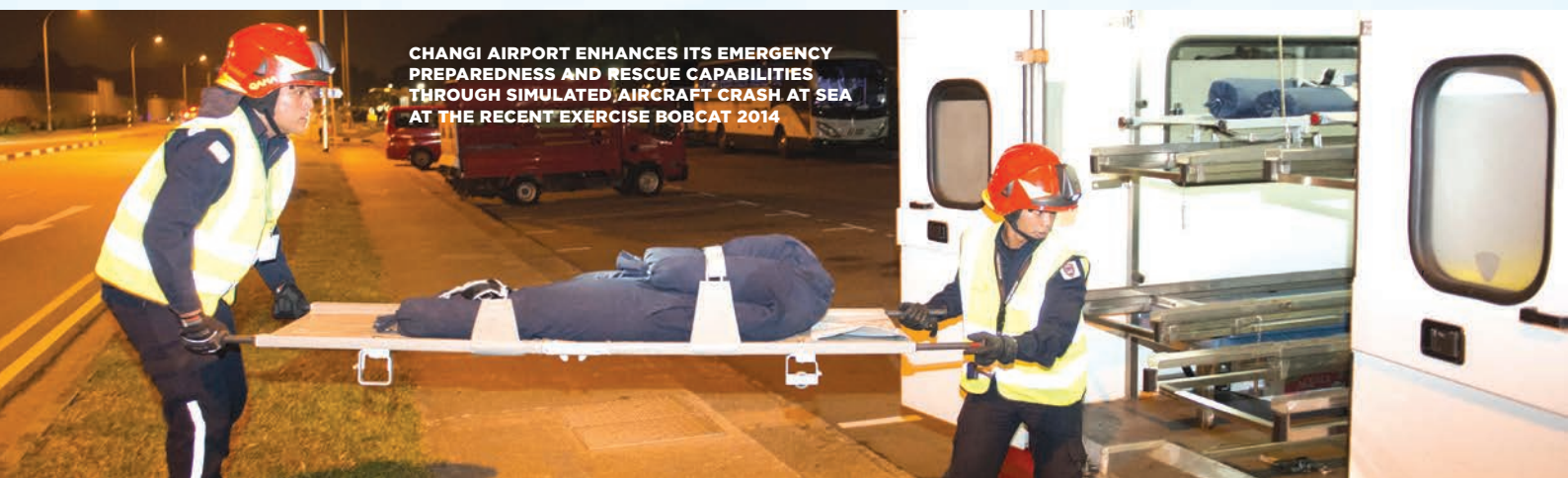
CHANGI AIRPORT ENHANCES ITS EMERGENCY PREPAREDNESS AND RESCUE CAPABILITIES THROUGH SIMULATED AIRCRAFT CRASH AT SEA AT THE RECENT EXERCISE BOBCAT 2014

In addition to the drills run at Changi Airport, CAG also studies the crisis frameworks of counterpart airports all over the world, to learn from their best practices in handling crises. - NG KOON LING