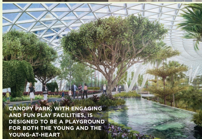
CANOPY PARK, WITH ENGAGING AND FUN PLAY FACILITIES, IS DESIGNED TO BE A PLAYGROUND FOR BOTH THE YOUNG AND THE YOUNG-AT-HEART