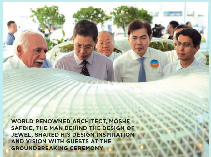
WORLD RENOWNED ARCHITECT, MOSHE SAFDIE, THE MAN BEHIND THE DESIGN OF JEWEL, SHARED HIS DESIGN INSPIRATION AND VISION WITH GUESTS AT THE GROUNDBREAKING CEREMONY

A much larger basement car park with 2,500 parking spaces will be built as part of the Jewel complex, providing T1 users with sheltered parking directly connected to the terminal. Facilities for taxis and coaches will also be expanded.