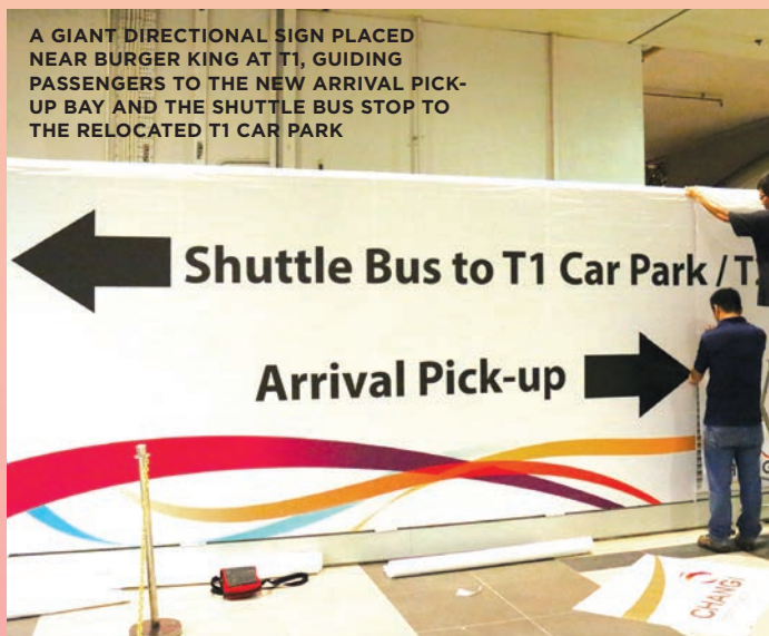
A GIANT DIRECTIONAL SIGN PLACED NEAR BURGER KING AT T1, GUIDING PASSENGERS TO THE NEW ARRIVAL PICK-UP BAY AND THE SHUTTLE BUS STOP TO THE RELOCATED T1 CAR PARK

With the closure, Changi Airport will embark on another era, as it charges ahead to be a leading tourist destination and a world-class air hub for Singaporeans and the rest of the world come 2018. – SHANNON LIM