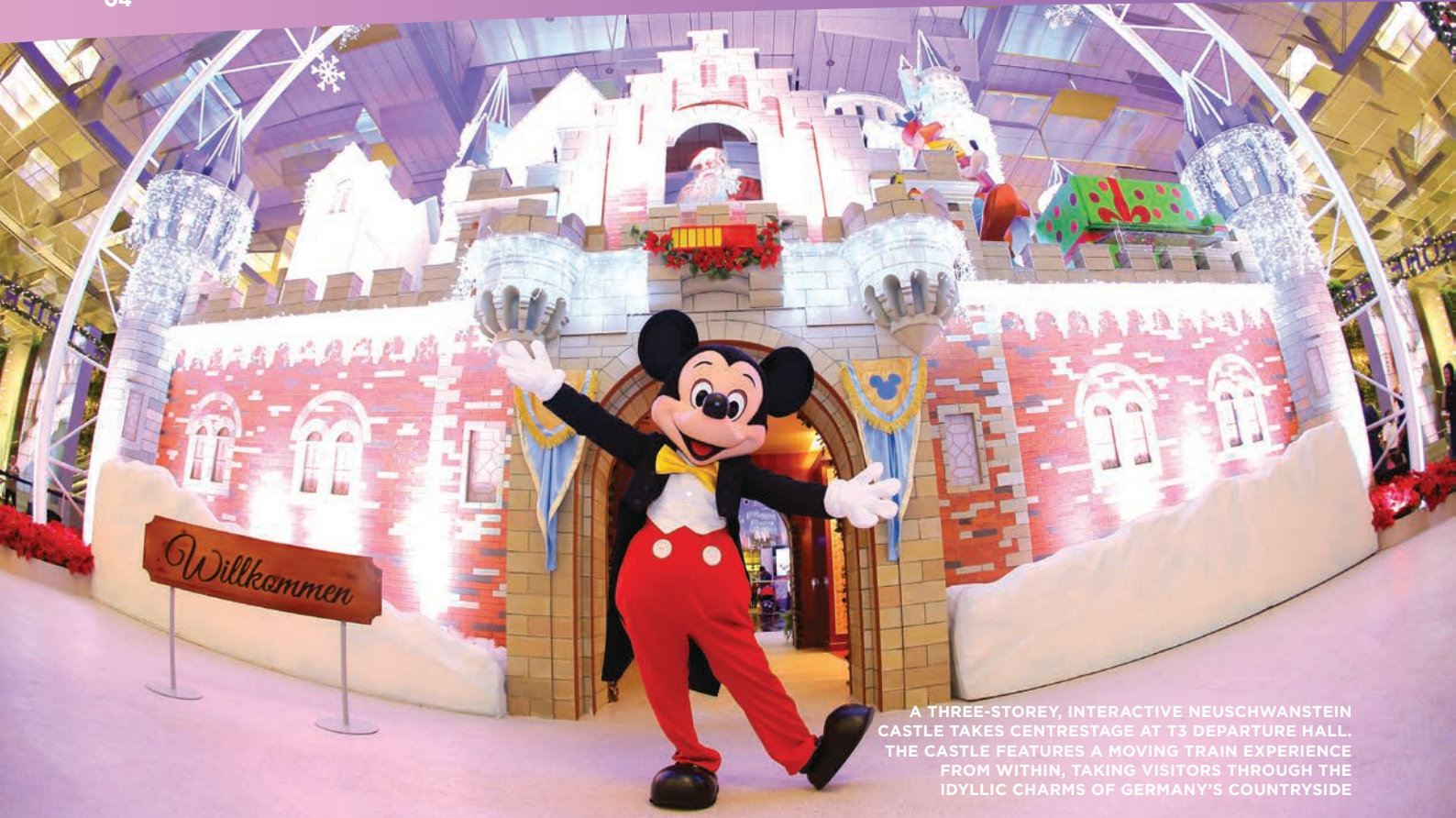
A THREE-STORY, INTERACTIVE NEUSCHWANSTEIN CASTLE TAKES CENTRESTAGE AT T3 DEPARTURE HALL. THE CASTLE FEATURES A MOVING TRAIN EXPERIENCE FROM WITHIN, TAKING VISITORS THROUGH THE IDYLIC CHARMS OF GERMANY'S COUNTRYSIDE