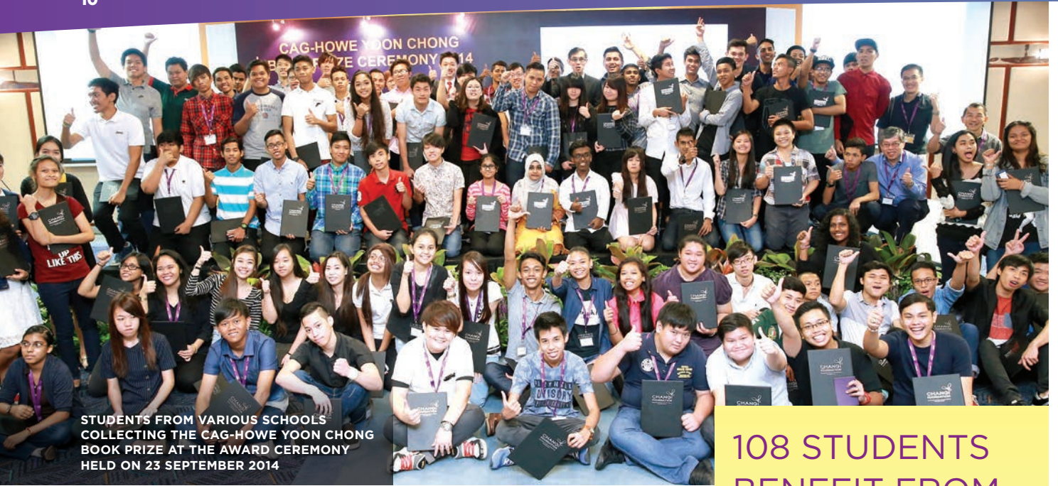
STUDENTS FROM VARIOUS SCHOOLS COLLECTING THE CAG-HOWE YOON CHONG BOOK PRIZE AT THE AWARD CEREMONY HELD ON 23 SEPTEMBER 2014