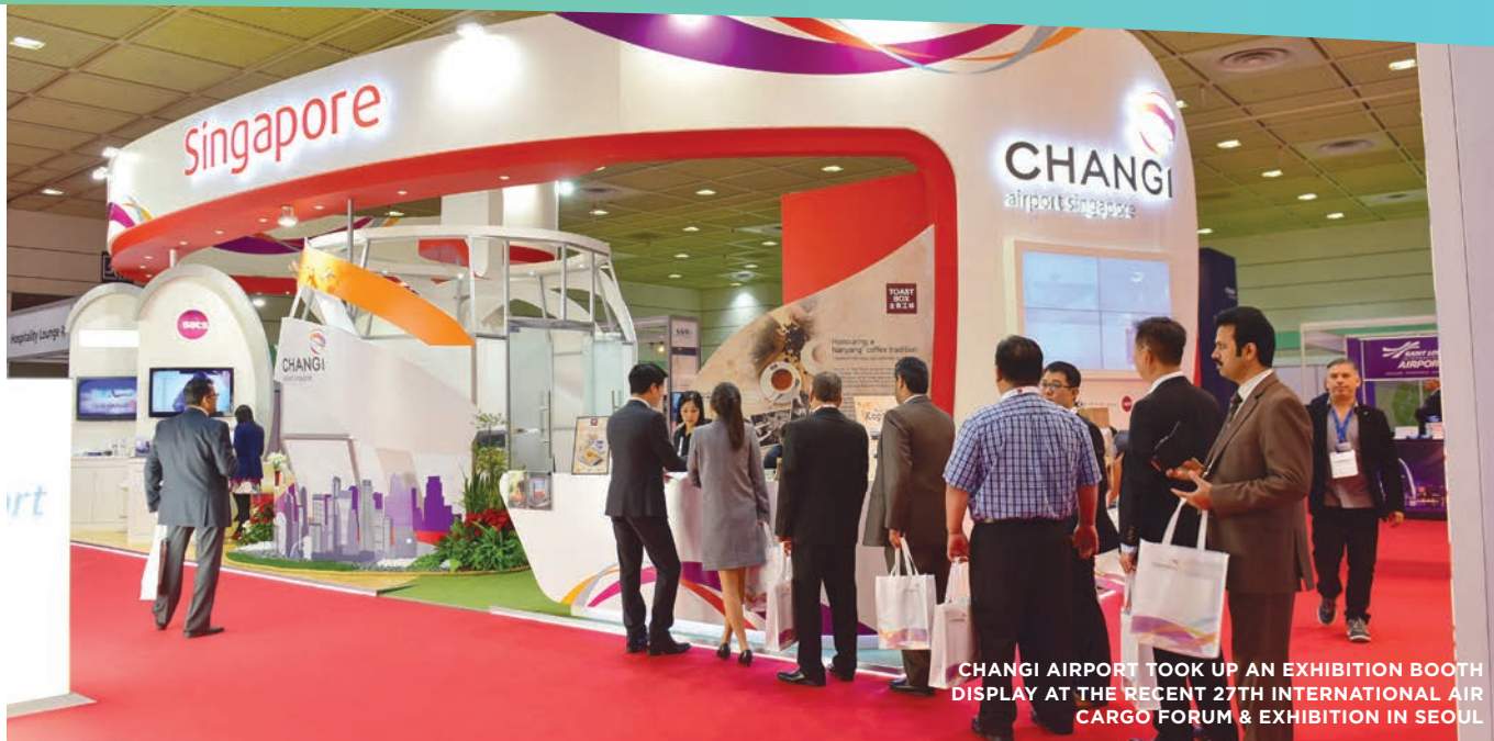
CHANGI AIRPORT TOOK UP AN EXHIBITION BOOTH DISPLAY AT THE RECENT 27TH INTERNATIONAL AIR CARGO FORUM & EXHIBITION IN SEOUL