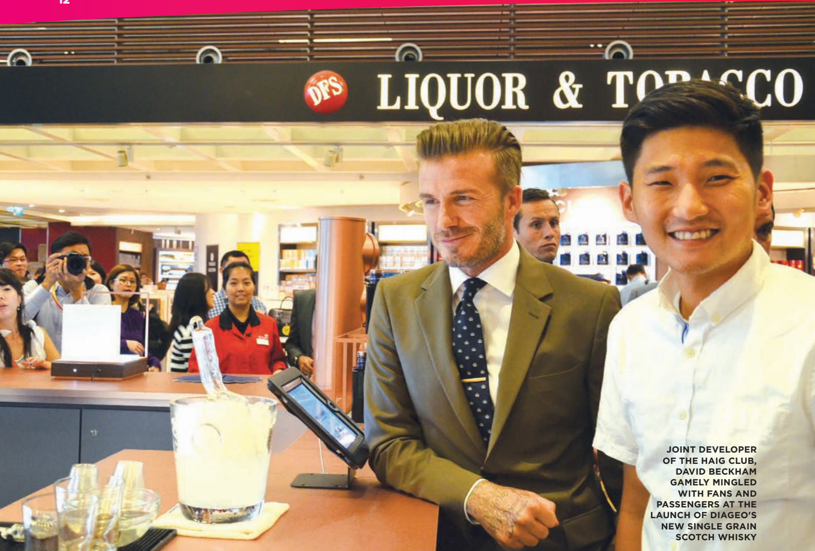
JOINT DEVELOPER OF THE HAIG CLUB, DAVID BECKHAM GAMELY MINGLED WITH FANS AND PASSENGERS AT THE LAUNCH OF DIAGEO'S NEW SINGLE GRAIN SCOTCH WHISKY