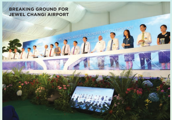
BREAKING GROUND FOR JEWEL CHANGI AIRPORT