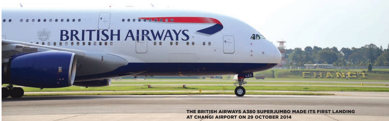
THE BRITISH AIRWAYS A380 SUPERJUMBO MADE ITS FIRST LANDING AT CHANGI AIRPORT ON 29 OCTOBER 2014