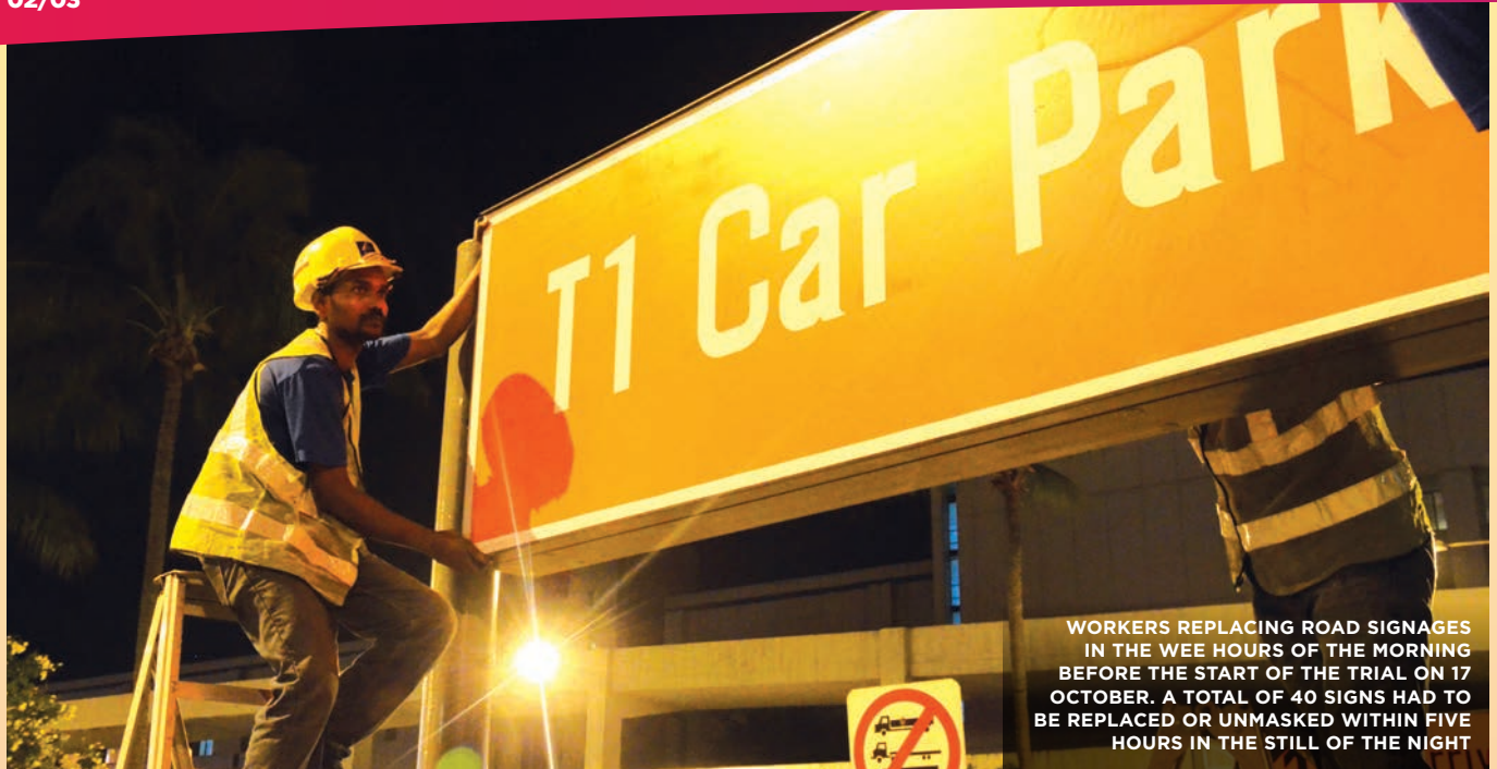
WORKERS REPLACING ROAD SIGNAGES IN THE WEE HOURS OF THE MORNING BEFORE THE START OF THE TRIAL ON 17 OCTOBER. A TOTAL OF 40 SIGNS HAD TO BE REPLACED OR UNMASKED WITHIN FIVE HOURS IN THE STILL OF THE NIGHT