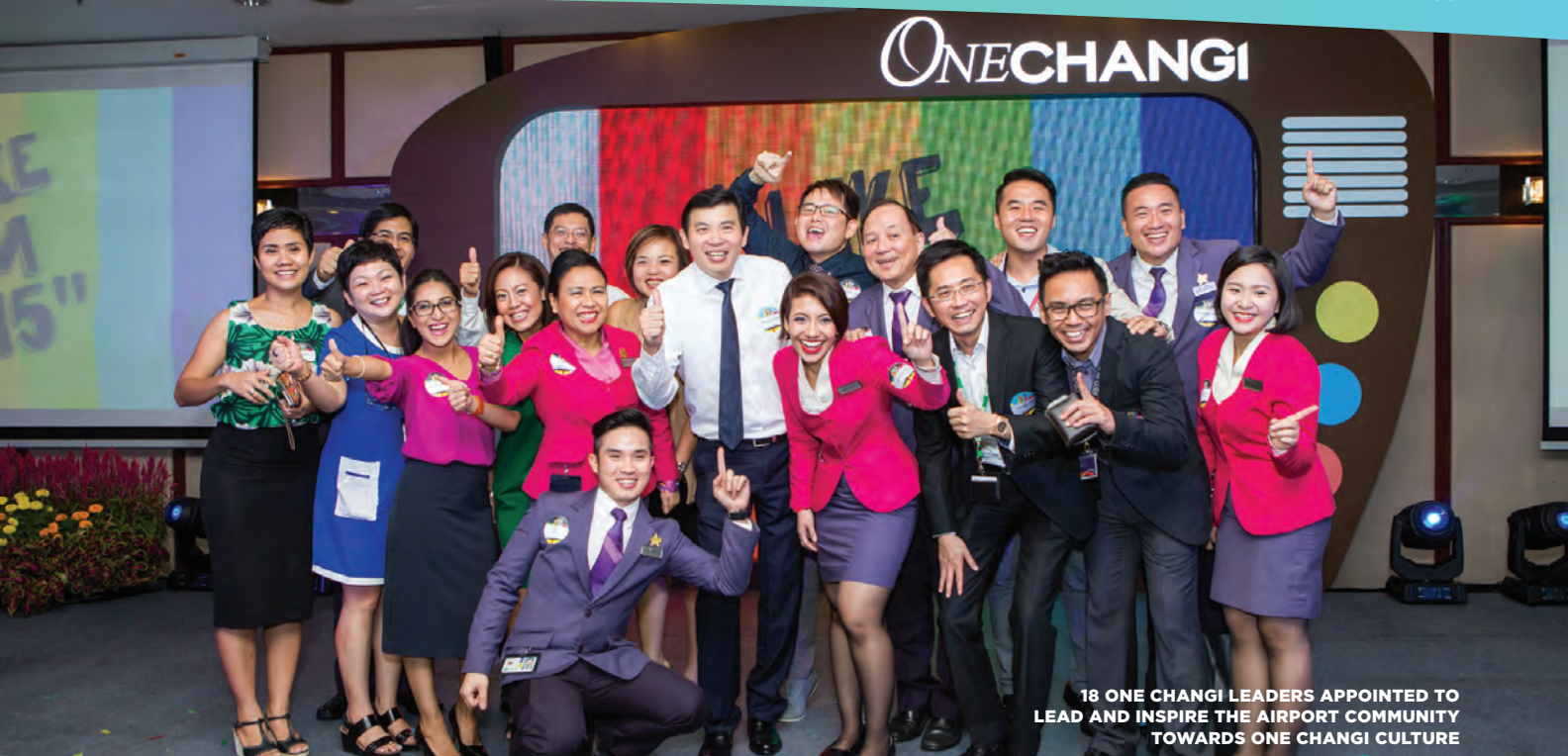
18 ONE CHANGI LEADERS APPOINTED TO LEAD AND INSPIRE THE AIRPORT COMMUNITY TOWARDS ONE CHANGI CULTURE