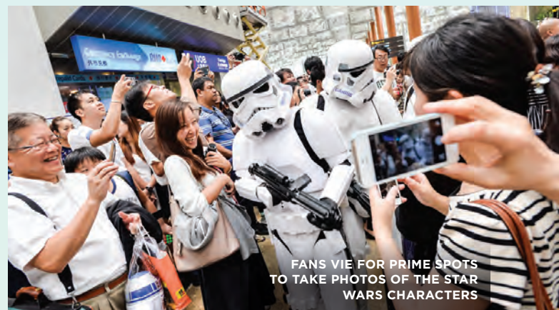
FANS VIE FOR PRIME SPOTS TO TAKE PHOTOS OF THE STAR WARS CHARACTERS

For more information on the 2015 Christmas celebrations at Changi Airport, visit www.changiairport.com/starwars.