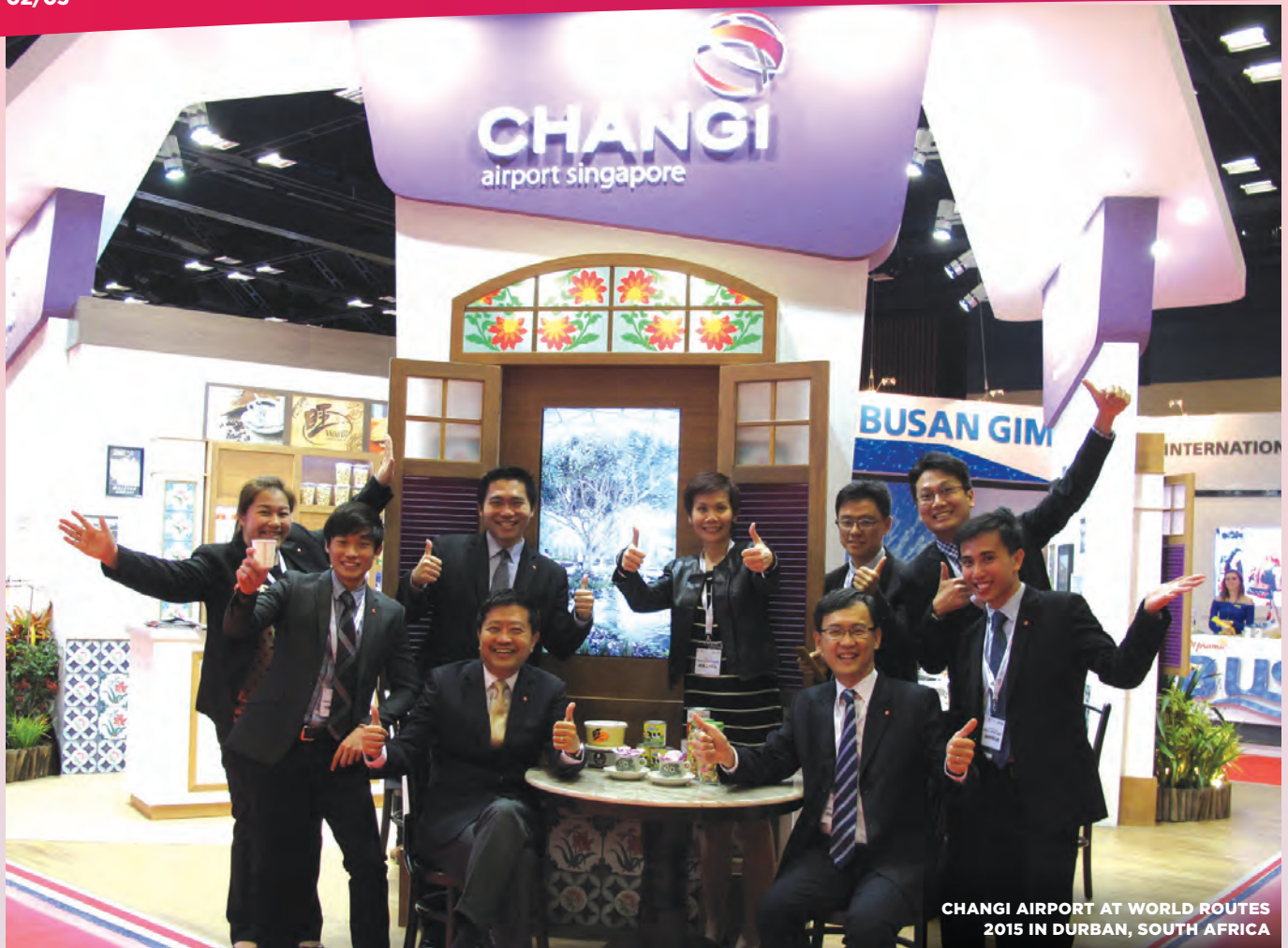
CHANGI AIRPORT AT WORLD ROUTES 2015 IN DURBAN, SOUTH AFRICA