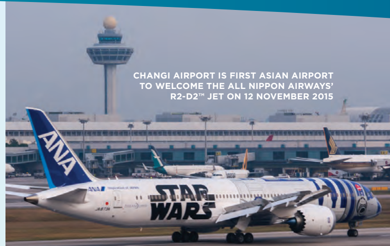
CHANGI AIRPORT IS FIRST ASIAN AIRPORT TO WELCOME THE ALL NIPPON AIRWAYS' R2-D2™ JET ON 12 NOVEMBER 2015