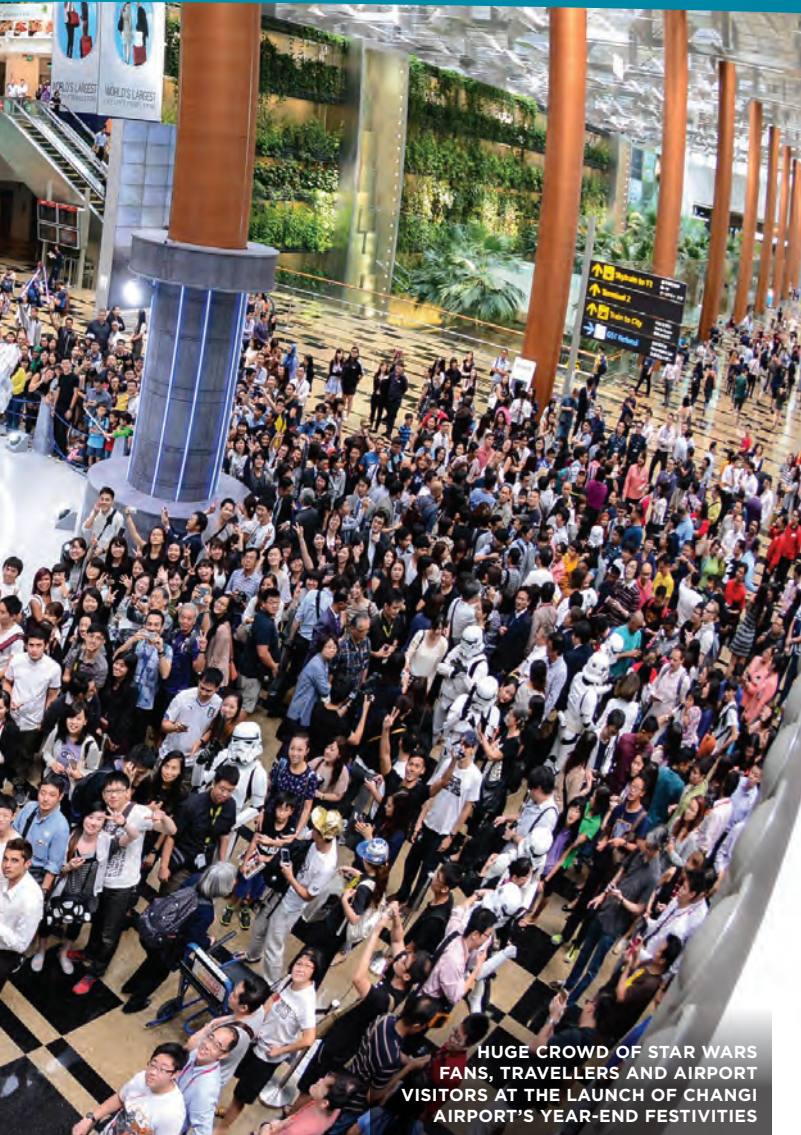
HUGE CROWD OF STAR WARS FANS, TRAVELLERS AND AIRPORT VISITORS AT THE LAUNCH OF CHANGI AIRPORT'S YEAR-END FESTIVITIES