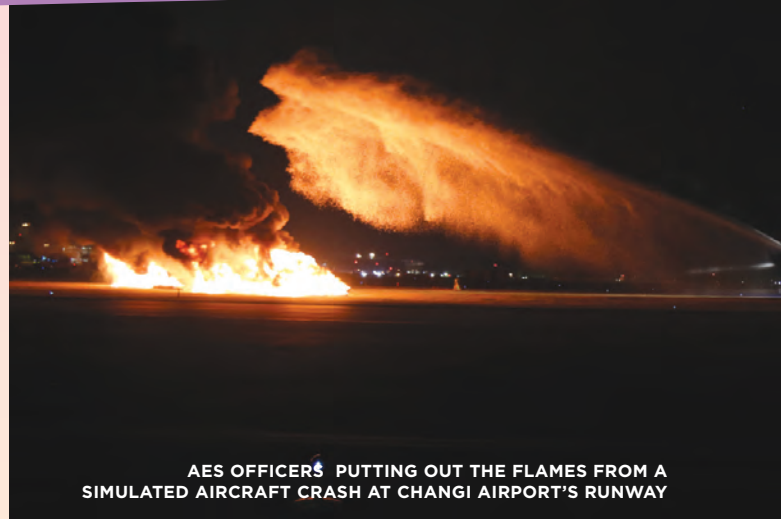
AES OFFICERS PUTTING OUT THE FLAMES FROM A SIMULATED AIRCRAFT CRASH AT CHANGI AIRPORT'S RUNWAY

For this exercise, CAG also rolled out a new crisis management initiative, the Changi Airport Self-Help