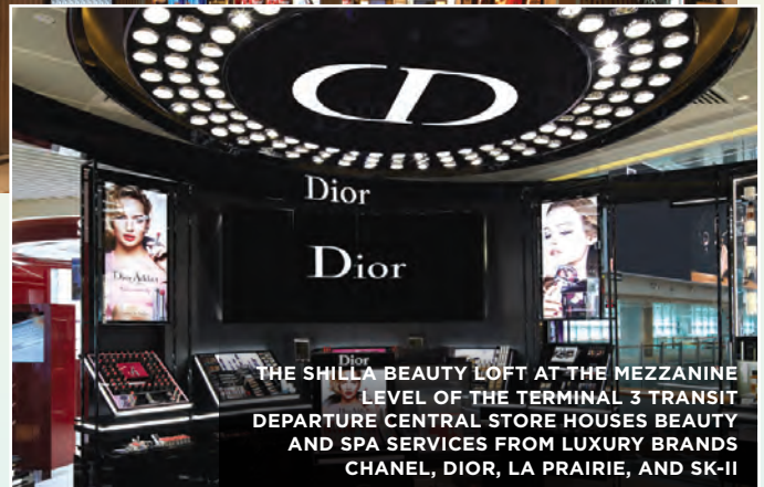
THE SHILLA BEAUTY LOFT AT THE MEZZANINE LEVEL OF THE TERMINAL 3 TRANSIT DEPARTURE CENTRAL STORE HOUSES BEAUTY AND SPA SERVICES FROM LUXURY BRANDS CHANEL, DIOR, LA PRAIRIE, AND SK-II

Located on the mezzanine level of the beauty duplex store at Terminal 3 Departure Transit Hall, The Shilla Beauty Loft features four exclusive brands – Chanel, Dior, La Prairie and SK-II. Each brand provides premium beauty facilities and services, offering a