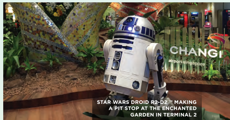
STAR WARS DROID R2-D2™ MAKING A PIT STOP AT THE ENCHANTED GARDEN IN TERMINAL 2