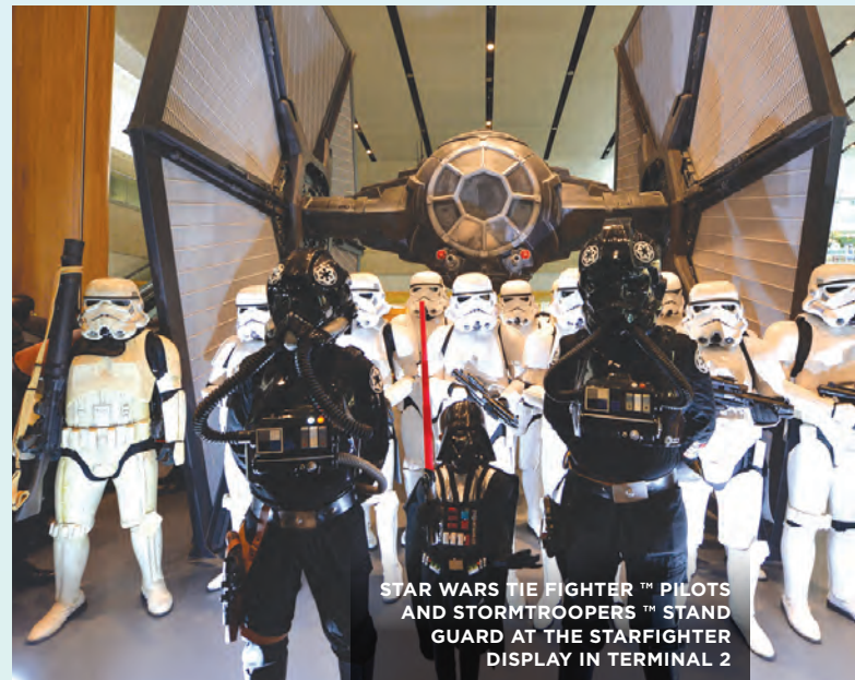
STAR WARS TIE FIGHTER™ PILOTS AND STORMTROOPERS™ STAND GUARD AT THE STARFIGHTER DISPLAY IN TERMINAL 2

comes complete with a life-sized TIE Fighter™ display. Guarded by five Stormtroopers™ in the latest incarnation of their signature white armor, the Star Wars display is indeed a sight to behold. The adventure continues with weekly character greetings featuring X-wing™ fighter pilots and Imperial Stormtroopers™ every Saturday at 4pm, from 14 November 2015 to 2 January 2016 (except 19 December). In addition, Changi Airport was the first Asian airport outside of Japan to welcome All Nippon Airways' (ANA) R2-D2™ jet, which made a special visit to greet some very lucky fans in Singapore. On 14 November, 40 delighted fans went on board the aircraft for a special tour and experience.