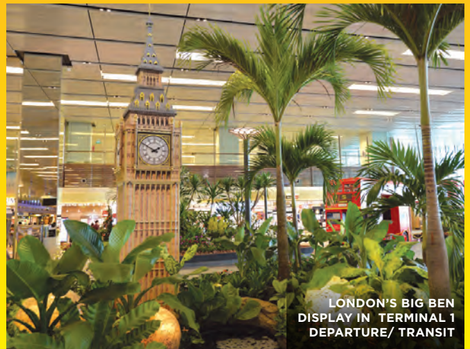
LONDON'S BIG BEN DISPLAY IN TERMINAL 1 DEPARTURE/ TRANSIT

This festive season, passengers at Changi Airport will get a chance to take photos at some of the world's famous landmarks even before they embark on their travel journey. Captivating displays of icons such as the London Bus, the Tower Bridge, and the majestic Plaza De Espana of Spain are set up in the airport's departure transit halls for passengers to snap away to capture their holiday moments. During the year-end holiday season, airport visitors can also look forward to being entertained by interactive stage and roving performances.