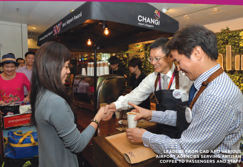
LEADERS FROM CAG AND VARIOUS AIRPORT AGENCIES SERVING ARTISAN COFFEE TO PASSENGERS AND STAFF