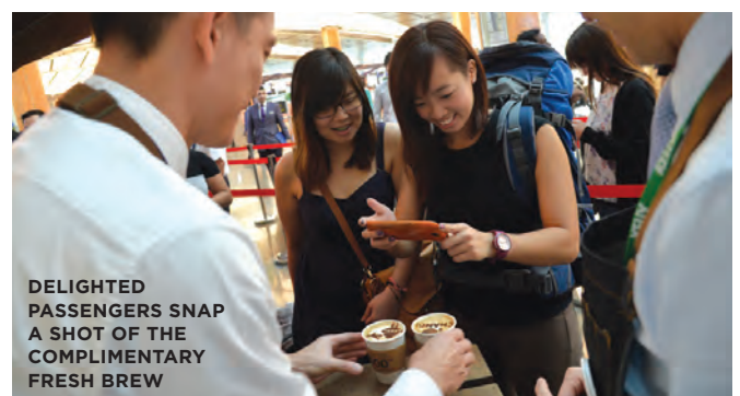
DELIGHTED PASSENGERS SNAP A SHOT OF THE COMPLIMENTARY FRESH BREW

The two-day event saw more than 10,000 cups of coffee served to airport guests and staff, leaving them feeling refreshed to start their day. - AMANDA SNG