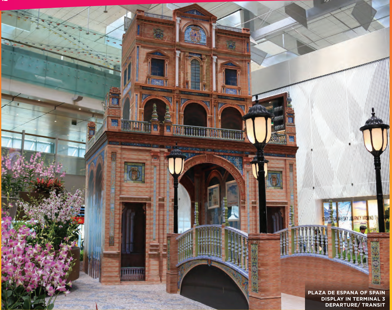
PLAZA DE ESPANA OF SPAIN DISPLAY IN TERMINAL 3 DEPARTURE/ TRANSIT