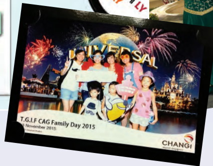
SNAPSHOTS OF FAMILY MEMORIES AT THE CAG FAMILY DAY 2015

The audience was then treated to an action-packed WaterWorld stage show filled with death-defying stunts and spectacular pyrotechnics, which set the tone for the many thrilling rides that followed thereafter. Staff and their families got to roam all seven zones of the park while spending minimal time in the attractions' queues.