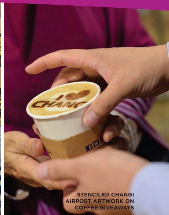
STENCILED CHANGI AIRPORT ARTWORK ON COFFEE GIVEAWAYS